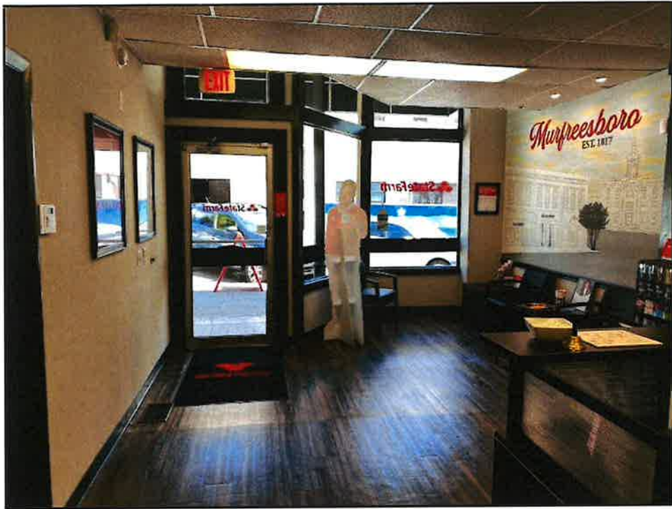
Interior of 123 N. Maple Street